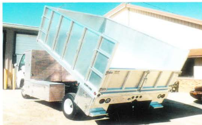
18. Special dump body set up using a "Back Pack" behind the cab. "Back Packs" provide extra storage for large tools, shovels, etc.. Please note the removable stake sides for multiple use.