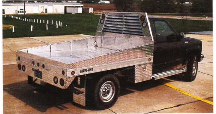
7. Our most popular truck bed package. Louvers and lights, tapered side boards, underbody tool boxes, mudflaps, and fifth wheel trap door.