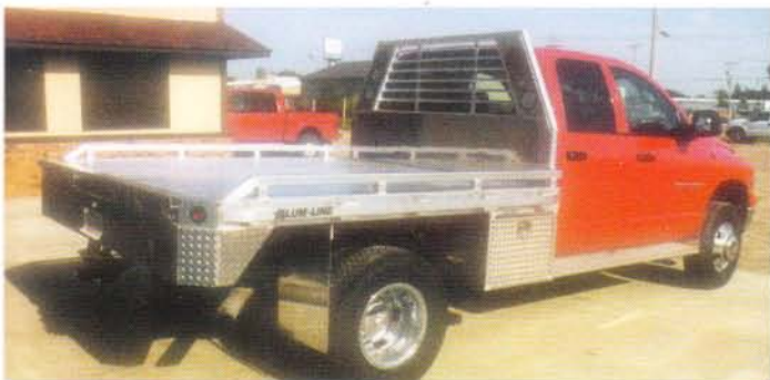
11. We will build any size bed to fit your dimensions. Light weight beds are an ideal alternative to pickup boxes and give you more universal uses. Pictured with tapered rear corners.