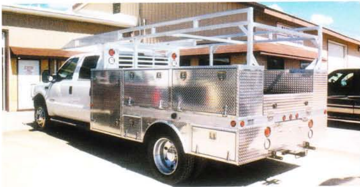
5. Overhead ladder racks can be made permanent or removable. Side boxes are available with double drop-down doors. Large front storage boxes.