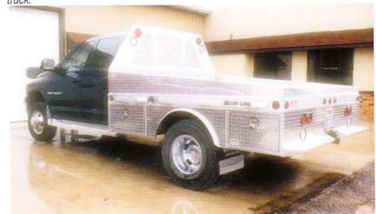
9. Give your bed a personal touch. Extra boxes, rub rail, wheel flairs, plus more. All types of lengths and widths available.