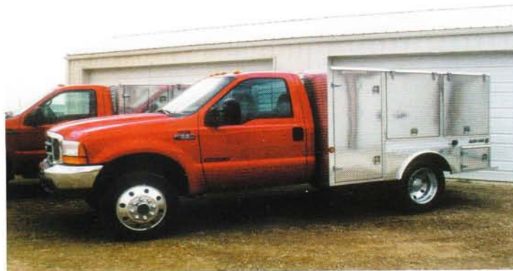
6. Special use service trucks can be designed to fit your needs. ALUM-LINE has designed a variety of bodies for rescue and brush fire service.