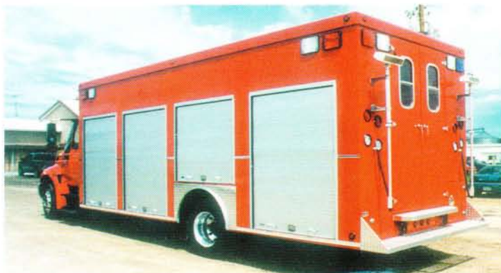
20. Rescue body with 60" box height. Four compartments per-side and finished in .125 smooth aluminum painted sides. Rear step bumper and rolled fender flares. More information is available on our complete line.