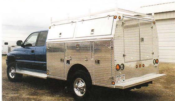
21. All types of customizing available including: shelving, transverse compartments, roll out trays, double pan doors, door stops, special latches, hanging hardware, and interior lighting. Our rescue bodies have been used and approved by the U.S. Army.