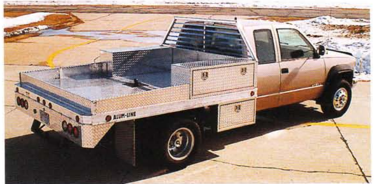
1. Truck bed with boxes on top and below. Finished with short sides and louvered bulkhead.