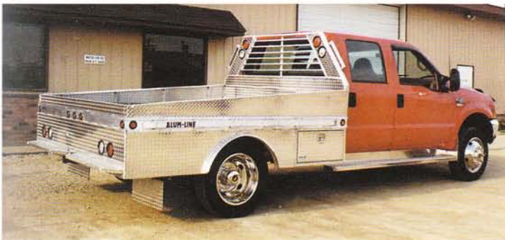
12. The above unit has 16" deep side skirting added to the platform. This will hide the frame and enclose the rear hitch area. Also note, the built-in tool box, sides, and step bumper. Skirting available on all models.