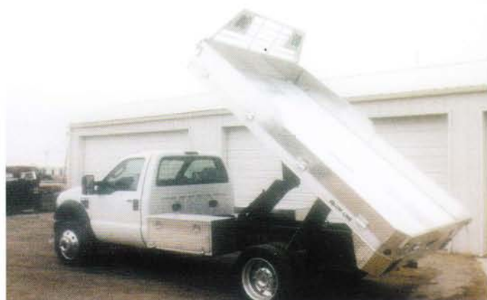
17. Bed capacities up-to 12 ton are available. Our extruded flooring offers easy dumping. Permanent solid sides come in a variety of heights and in either smooth, extruded, or diamond plate material.