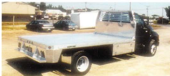
14. ALUM-LINE will build beds up-to 24' in-length and 20,000 lb capacities. Special strength features include: 1/2" thick outside rail, 3" I beam, 1/4" wall cross members on 12" centers, and 1 1/4" extruded flooring. Put our bed to the test... You will be very satisfied. All types of loading ramps available.