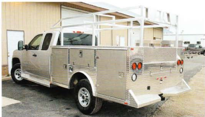
19. One of our most popular set ups. Compartment height at 40" with overhead ladder rack and step bumper. Other popular options include 4" deep flip top compartments on top, adjustable shelving, slide out trays, painted doors and much more. All models available in smooth or treadbrite aluminum construction.