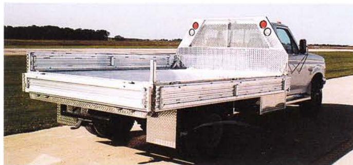
13. A 12' length standard platform with a mesh window protector. Please note the fold down sides. Available in various lengths. ALUM-LINE beds are easily converted to your next truck.