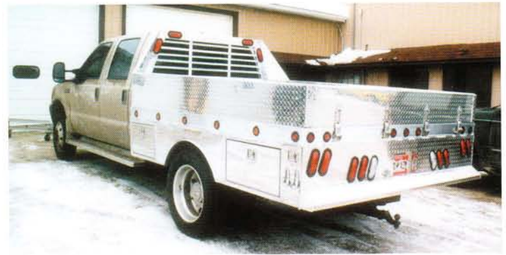
8. Another choice of sides can be matched to almost any inch increment you desire. All hitches used with ALUM-LINE beds are attached to the frame of the truck.