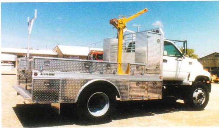
4. Beds can be designed with a frame cut-out to attach special use equipment. Side boxes can be built any height. Beds built tough enough for medium-duty trucks.