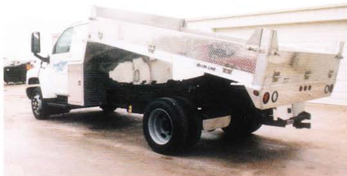
16. ALUM-LINE dump body platforms are heavy duty. Special strength options include; 1/2" thick outside framing with 1 1/4" extruded flooring. Channel long sills and heavy duty bulkheads complete the package.