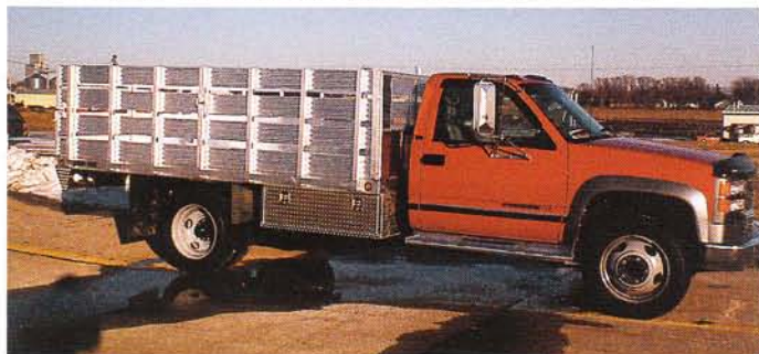
15. Truck bed with 36" high stake rails. Stake racks are available in any height or in solid sides. Sides are light weight and are easy to install or remove. Rear doors can be pull-out or swing-out design. Used with rub rail with stake pockets.