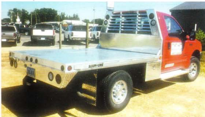
10. Standard package includes open window bulkhead, light package and stake pockets. Everything you need for a classy look. Popular options include louvers and lights, rub rail and under side boxes.