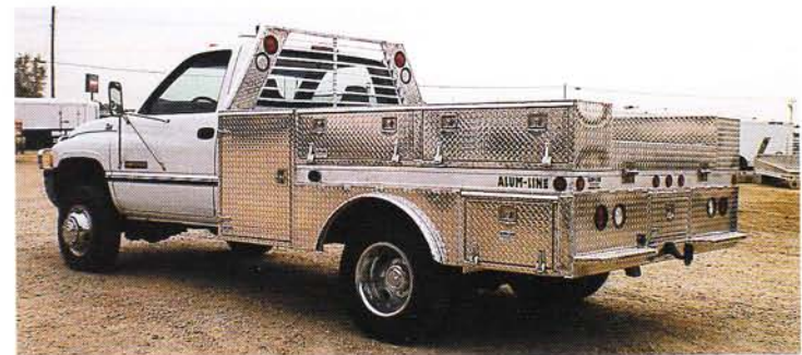
3. Component body. With our special front corner cutouts, you can have tall upright boxes yet the strength of a platform body. Extra storage includes removable top boxes and small boxes behind the wheels. A lower price alternative to a service body.