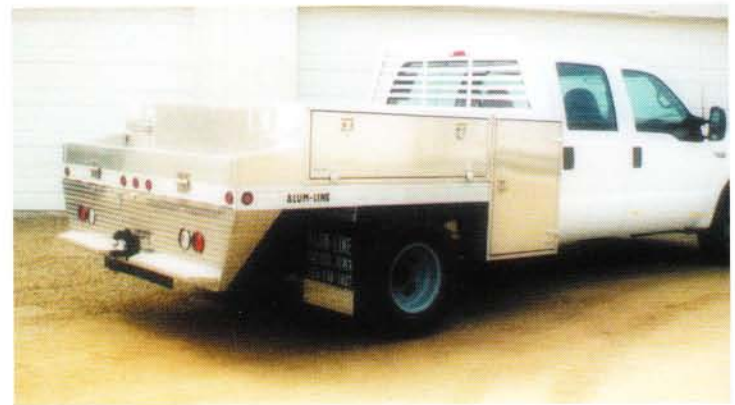
2. Equipped with optional above bed tool boxes, upright front tool boxes, rear step bumper, louvered bulkhead and short sides. You can build a body your way.